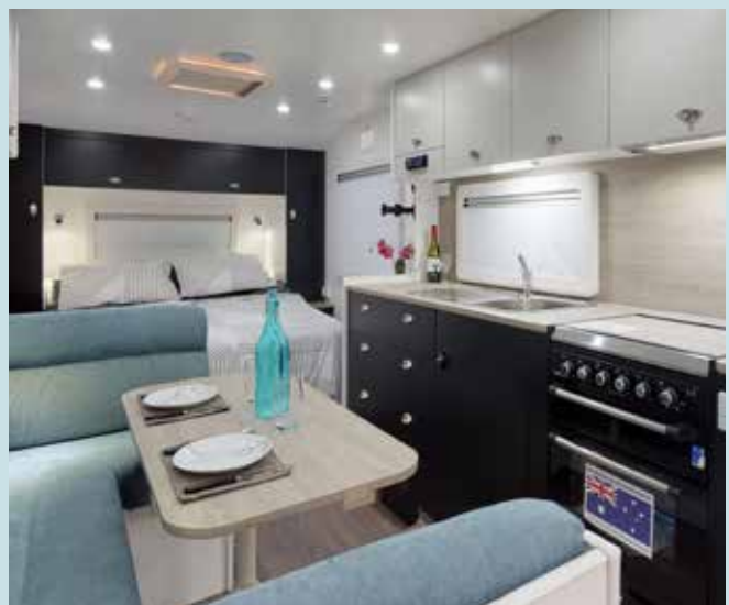
Layouts shown below apply to Tourister and Luxe versions. Visit our website at newlandscaravans.com.au for full specifications, layouts & photo gallery.